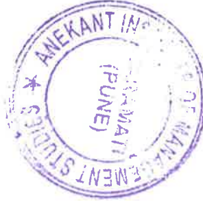
Coordinator, Code of Conduct Committee